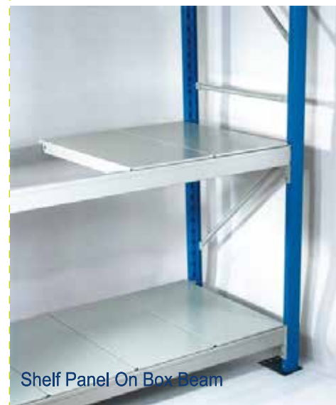
Shelf Panel On Box Beam