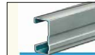
C Section Medium Duty Beam (2LSC) For use with chipboard or steel shelf panels. Lengths range from 1050mm to 1800