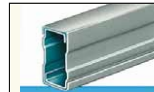
Box Heavy Duty Beam (2LBC) For use with chipboard or steel shelf panels. Lengths range from 1050mm to 2400