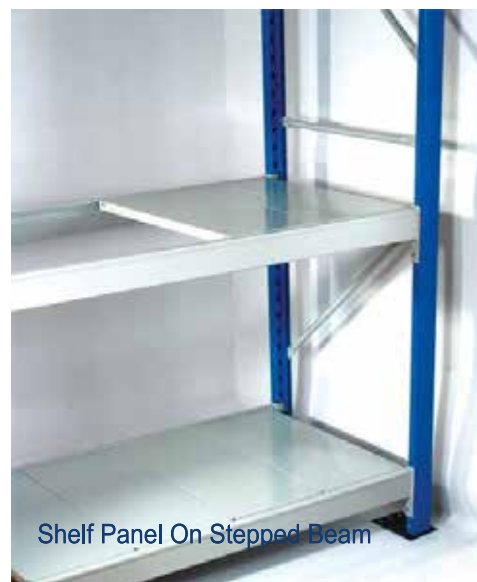
Shelf Panel On Stepped Beam