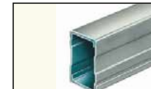
Box Extra Heavy Duty Beam (3LBC) For use with chipboard or steel shelf panels. Lengths range from 1050mm to 3000mm