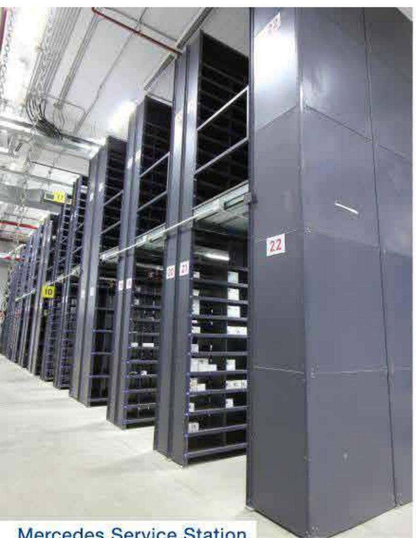
Mercedes Service Station