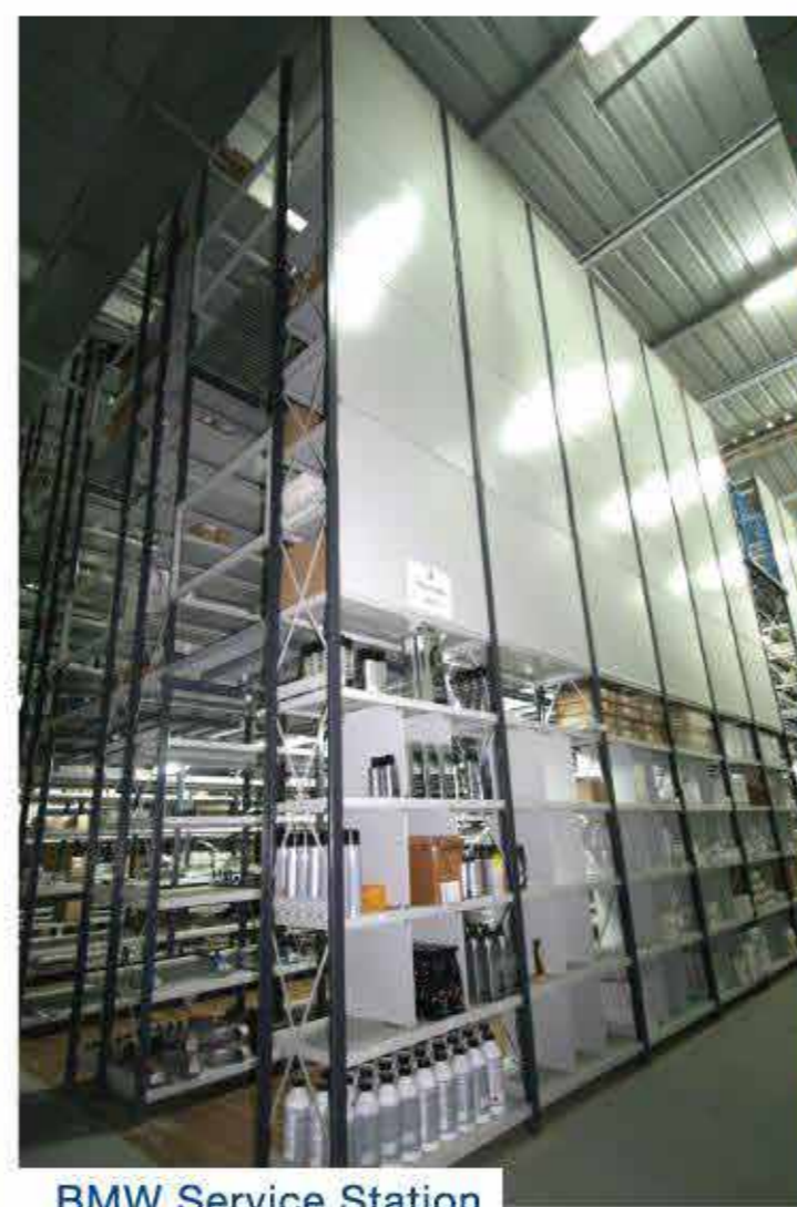
BMW Service Station