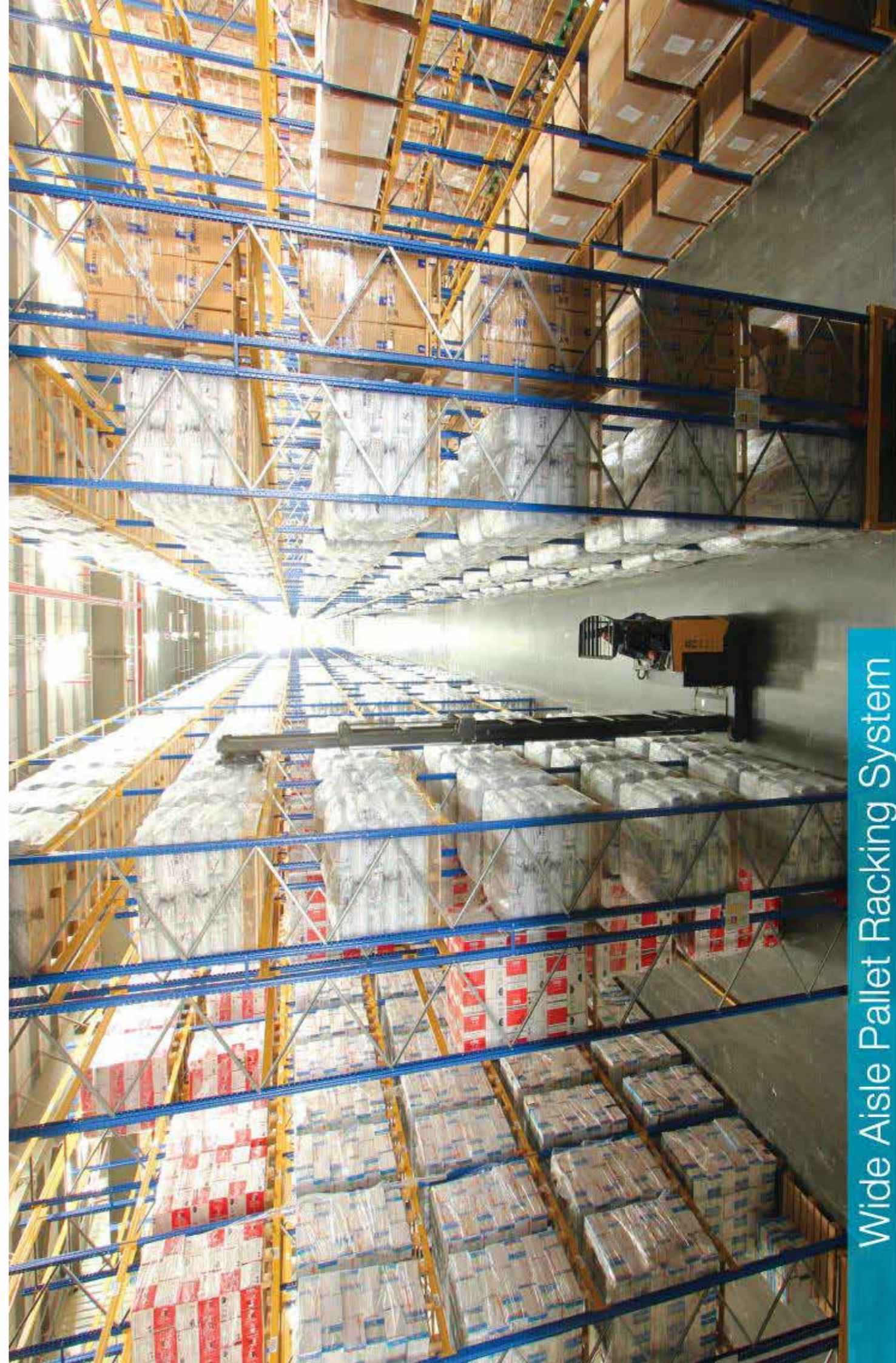
Wide Aisle Pallet Racking System