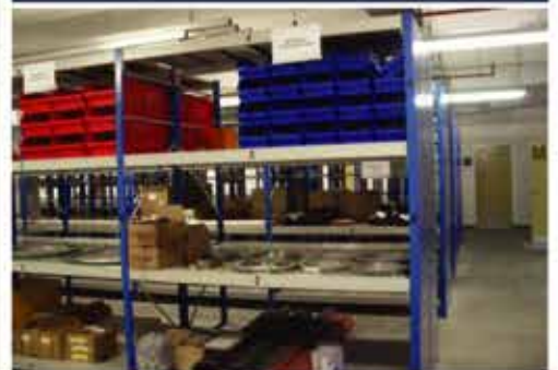
Link Misr Medium span